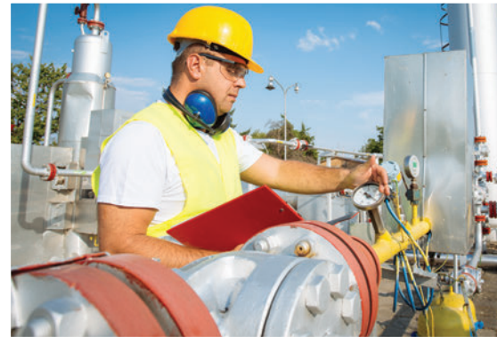
Commissioning & Maintenance