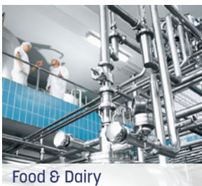
Food & Dairy