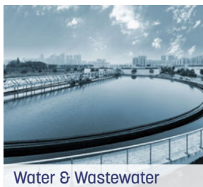
Water & Wastewater