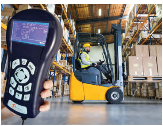
E-INSTRUMENTS Indoor Air Quality (IAQ) DELTA OHM Environmental / Weather SINTROL Dust Monitoring STATUS Humidity