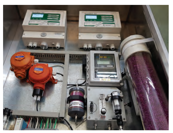
ADVANCED INSTRUMENTS Oxygen Analysers EDINBURGH Gas Analysers